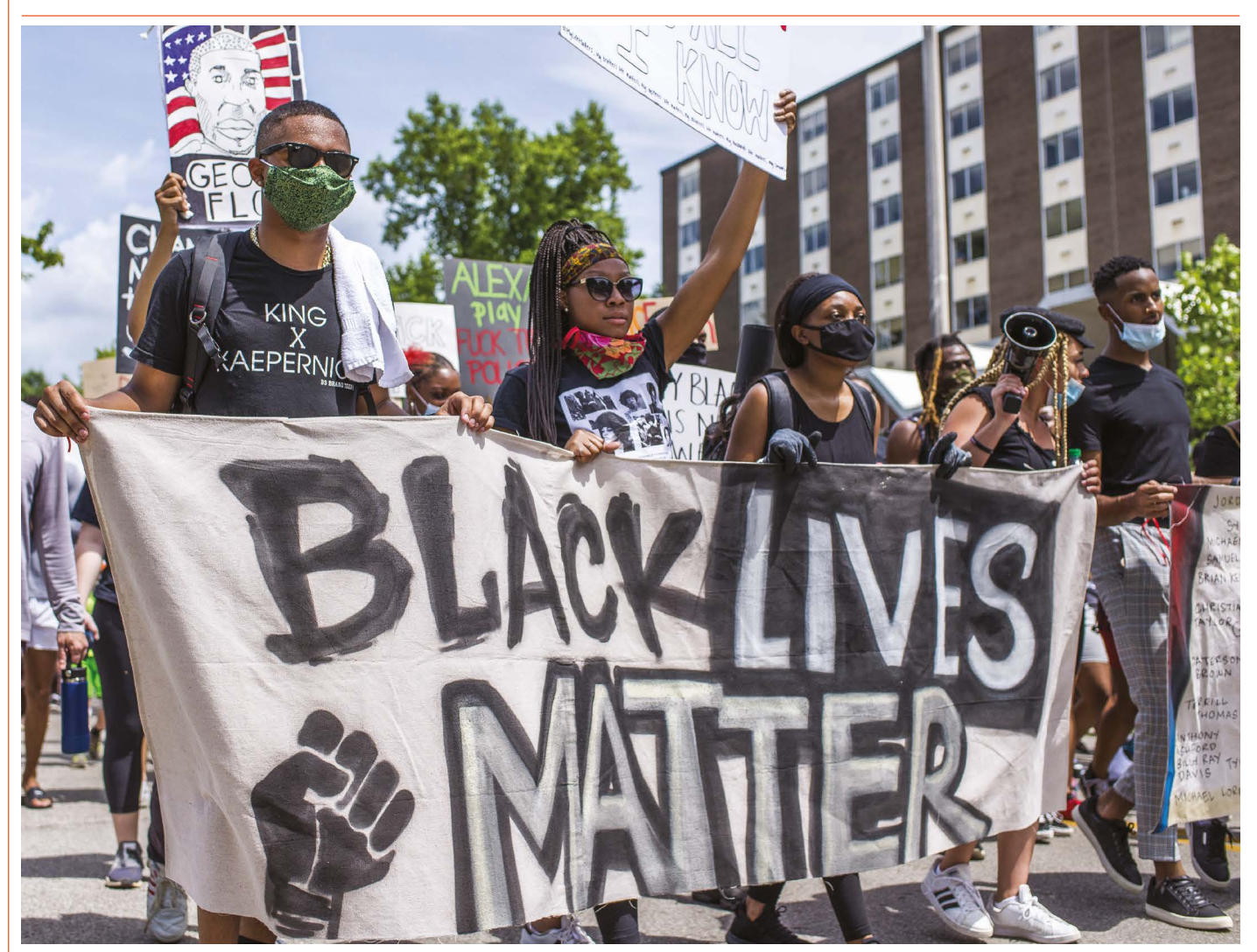
Demonstrators march at Indiana University Bloomington to protest against police violence during the Black Lives Matter protests.